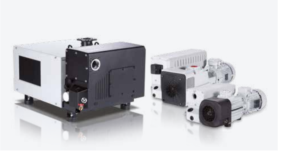
Typical SOGEVAC B models

Please refer to the full application listing matrix on page 4.