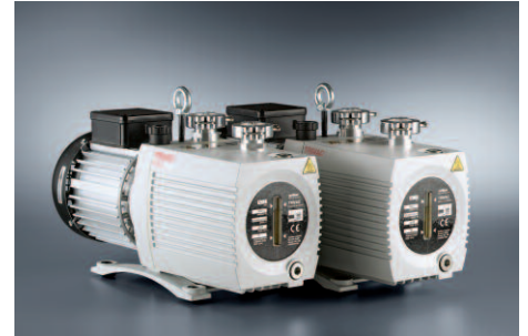
TRIVAC NT 5 and NT 10 with 3 phase motors