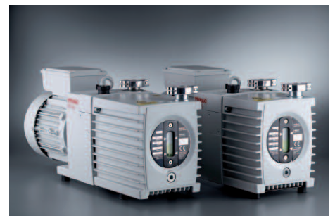
TRIVAC NT 25 and NT 16 with single phase motors